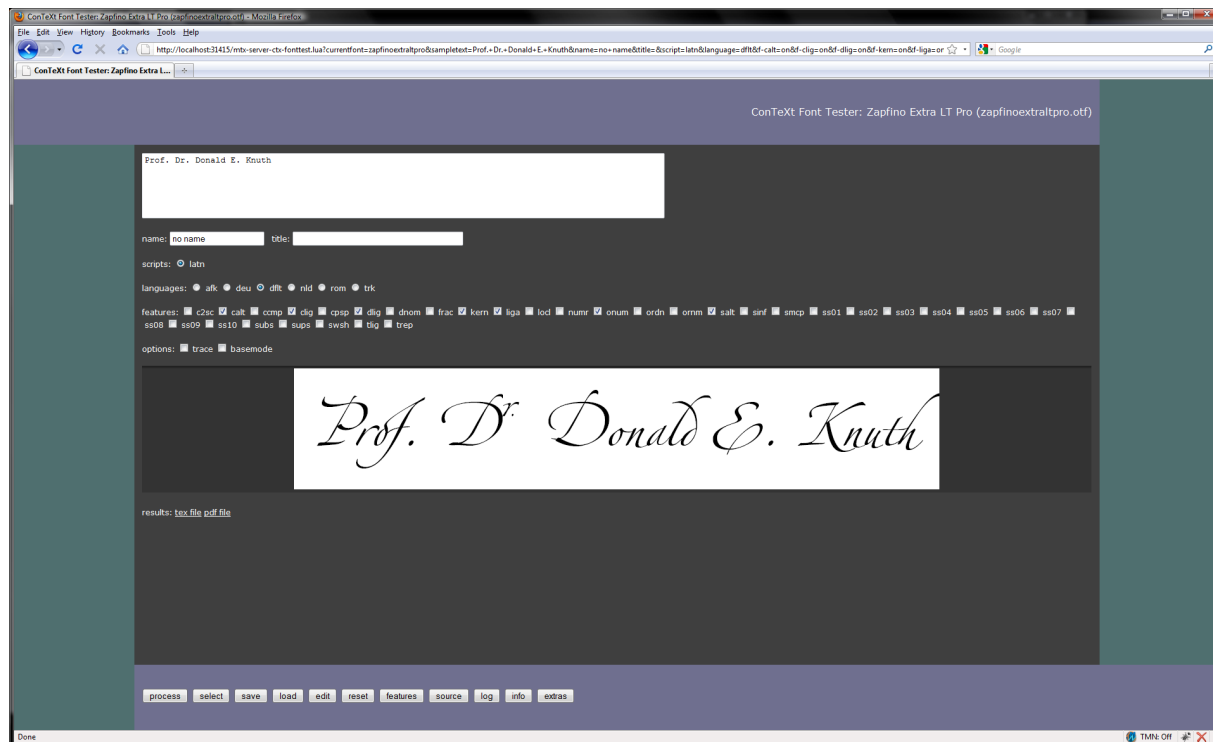
Figure 2. An example of using the font tester.

\endgraf score: \xmlfunction{#1}{totalscore} \blank \stopxmlsetups