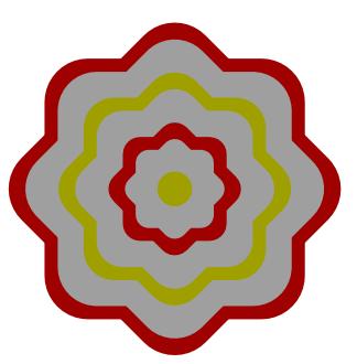
Figure 3 A METAPOST graphic embedded in a LATEX document.

Unfortunately, and unlike in context, the emp package does not allow the exchange of parameters between tex and metapost.